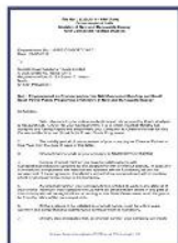
MNRE Channel Partner Certificate